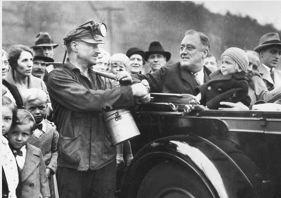
Franklin D. Roosevelt campaigns for President, Wheeling, West Virginia, October 1932.

This theme, that he would seize the moment of crisis to take away power from Wall Street, Roosevelt hammered home during his entire election campaign of 1932: ‘I believe, that our industrial and economic system is made for individual men and women, and not individual men and women for the benefit of the system.’