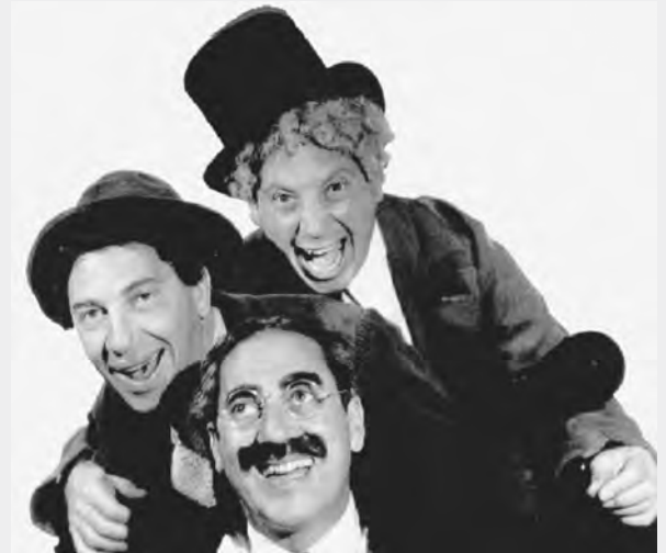
The Marx-ist entertainment family: Groucho, Chico, and Harpo—a far more useful group than the unfortunate Dummo.

ject of “The Hypotheses Which Underlie Geometry.” The essential step forward embodied in this work, is that the notion of dimensionality in physical processes, must be limited to discovered universal physical principles which, as what he terms, in German, Geistesmasse , have been validated as universal, that by a sufficiently unique quality of physical-experimental evidence. The popular notions of space, time, and matter, are thus excluded by competent modern science forever after, leaving only Riemann’s notion of physical-space-time in their place.