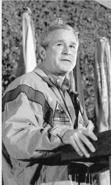
President Dummo: George W. Bush in Iraq.

Dummo is a sickening symptom of that disgraceful decadence of our nation's culture which disgusts the world at large today; but, it is not so much a judgment on President Dummo as upon the folly of the national mass of fools who are prepared to support, condone, or even prefer his re-election to a new term.