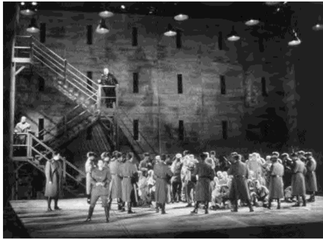
Prison guards surround inmates in this modern-dress production.