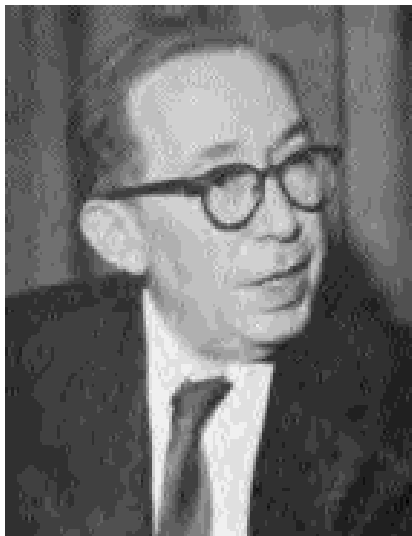
University of Chicago ideologue Leo Strauss: the fascist roots are key.