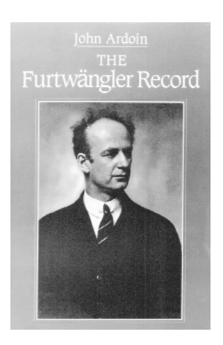
The Furtwängler Record by John Ardoin Amadeus Press, Portland, 1994 376 pages, hardbound, $32.95

"But wait a minute," someone might ask at this point, "Furtwängler conducted