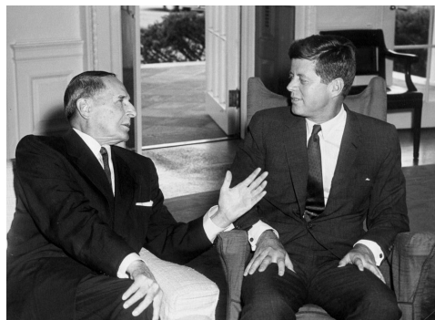
Meeting with General Douglas MacArthur, 1961

"Why in this past decade has not the United States consistently based its conduct of foreign affairs upon the recognition of every man's desire to be free? ...We fight to keep the world free from Communist imperialism—but in doing so we hamper our