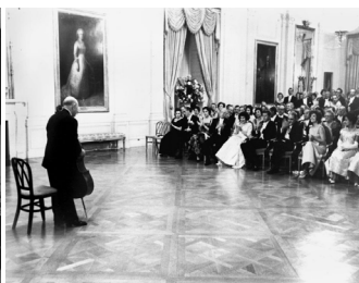
Cellist Pablo Casals performs at the White House, 1961