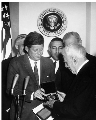
Presenting the Congressional Gold Medal to poet Robert Frost, 1962

—Speech at Amherst College, October 26, 1963