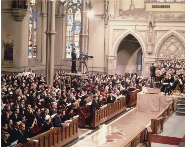
Maestro Leinsdorf conducts the performers from the platform on the right. Jacqueline Kennedy can be seen kneeling in the front row.