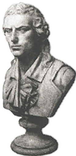
Friedrich Schiller Poet of Freedom

117 Mt. Pleasant Avenue Roxbury, MA 02119