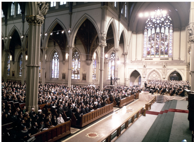
The Cathedral of the Holy Cross, filled to capacity on January 19, 1964. The chorus and orchestra appear on an elevated platform just below the large stained glass window.

Fifty years ago in this cathedral, on January 19th, 1964, Boston honored her fallen son, John Fitzgerald Kennedy, with a performance of Wolfgang Amadeus Mozart's final composition, the Requiem in D Minor . Holy Cross was filled to capacity with 1,800 people attending, including Jacqueline Kennedy and other members of the family, while 3,000 more gathered outside unable to get in. Millions of other Americans watched the performance live on a nationwide television broadcast.