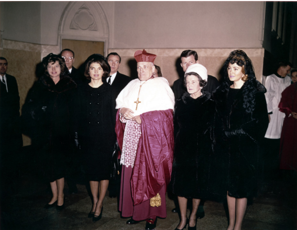
Members of the Kennedy family with Richard Cardinal Cushing following the Requiem performance on January 19, 1964