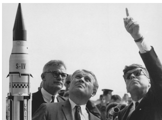
With Werner von Braun at Cape Canaveral, 1963

“Every drop of water which goes to the ocean without being used for power or used to grow, or being made available on the widest possible basis is a waste, and I hope that we will do everything we can to make sure that nothing runs to the ocean unused and wasted.” —Hanford Nuclear Generator, September 26, 1963