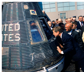
Inspecting the space capsule Friendship-7 with John Glenn, Cape Canaveral, 1962

The nuclear rocket program, to carry man into the depths of our solar system, was slated to become operational by the mid-1970s. Kennedy visited the Nuclear Rocket Development Station in December 1962, to publicly display his support for the program. As Kennedy