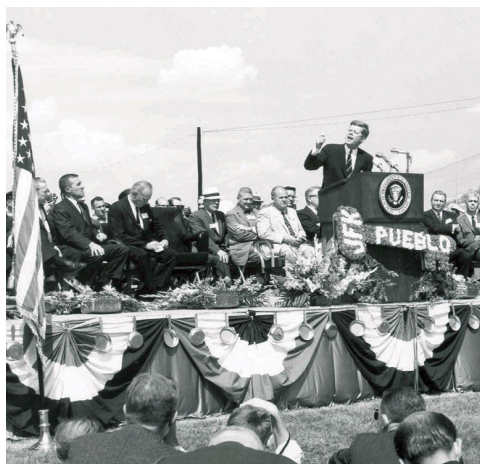
Speaking at the Dedication of the Fryingpan-Arkansas Dam project in Pueblo, Colorado, 1962

which he inspired have been left undone. Here is the vision that Kennedy possessed: