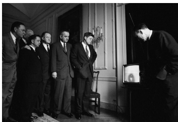
Watching the lift-off of John Glenn with staff at the White House, 1962

emphasized, with a commitment to both chemical propulsion and nuclear propulsion simultaneously, the lunar landing would be only a beginning, with a Mars trip scheduled by the end of the following decade, and a permanent lunar base by the 1980s.