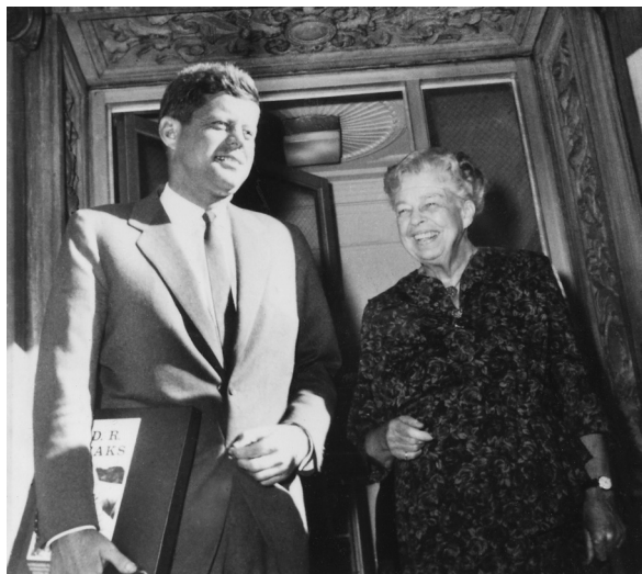
John Kennedy and Eleanor Roosevelt in New York, October 11, 1960.