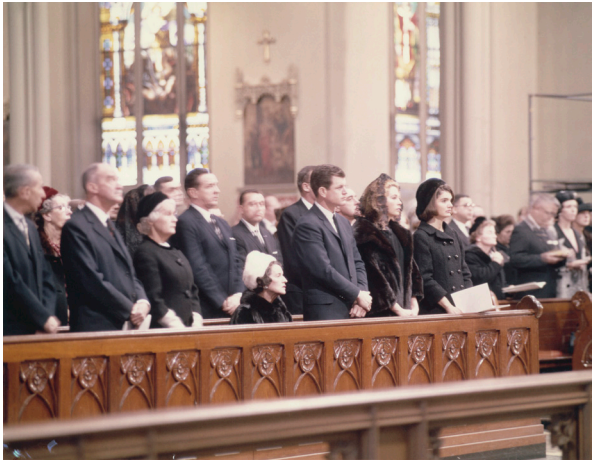
Jacqueline Kennedy and other members of Kennedy family attend the Requiem on January 19th, 1964 at Boston's Holy Cross Cathedral

"A man may die, nations may rise and fall, but an idea lives on. Ideas have endurance without death." —February 8, 1963