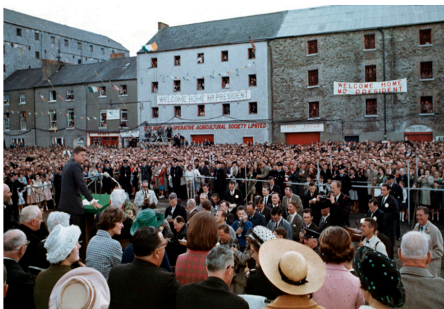
Speaking to the crowd in County Wexford, Ireland, his family's ancestral home.

Kennedy also intended to extend Franklin Roosevelt's TVA model to all river basins in the United States. Kennedy identified the problem in a special message to Congress: "Our supply of water is not always consistent with our needs of time and place. Floods one day in one section may be countered in other days or in other sections by severe water shortages... Our available water supply must be used to give maximum benefits for all purposes—hydroelectric power, irrigation and reclamation, navigation, recreation, health, home and industry."