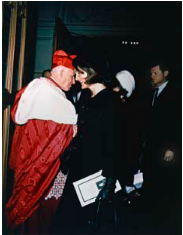
Jacqueline Kennedy speaks with Cardinal Cushing following the Requiem performance and Mass.