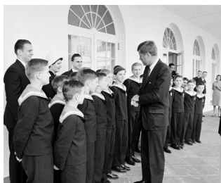
Greeting members of the Vienna Boys' Choir at the White House, 1962